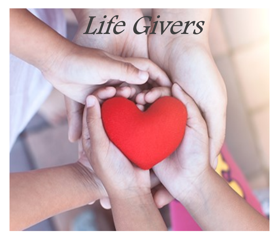
Spouses That Give Life Genesis 2:18-24; Ephesians 5:21-33